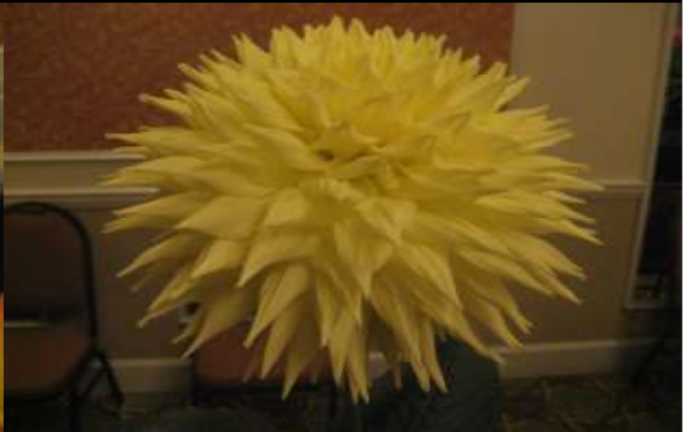
TROOPER DAN A-SC-YL BEST A IN THE 2010 NATIONAL SHOW. DICK WESTFALL ENTRY