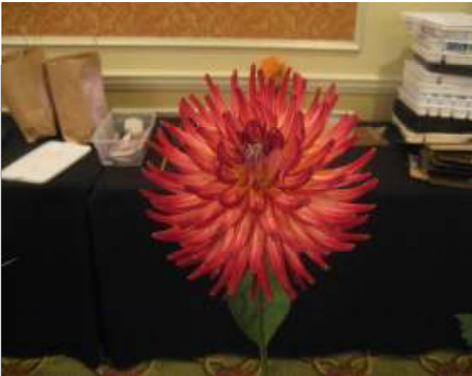
CRAZY 4 JESSEE BB-IC-DB DR/YL BEST BB IN THE 2010 NATIONAL SHOW. BUDDY DEAN ENTRY