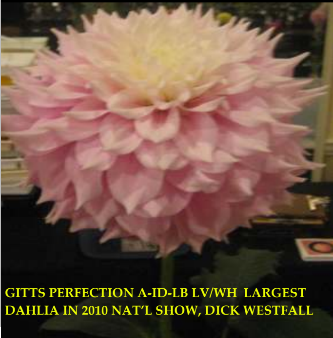
GITTS PERFECTION A-ID-LB LV/WH LARGEST DAHLIA IN 2010 NAT'L SHOW, DICK WESTFALL