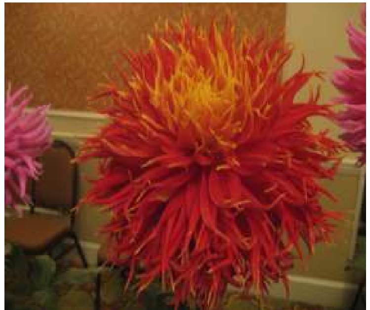
SHOW & TELL A-LC-DB RD/YL THIS BLOOM WON THE BEST A- LC BLOOM IN THE 2010 NATIONAL SHOW IN CHATTANOOGA. IT WAS AVERY LARGE BLOOM FOR THIS FLOWER.