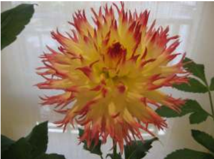
MY BEVERLY B-LC-LB DP/Y

large screen so all can see. The pictures of the bloom were a big hit last year as it was our first attempt of using a computerized system and it makes it so easy for buyers to see what they are purchasing. Attendees becoming members will receive a $10 discount in Dahlia Bucks towards your purchases. COME TO THE 2007 TUBER SALE.