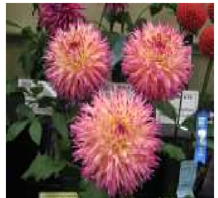
NENEKAZI B-LC-LB R/PK