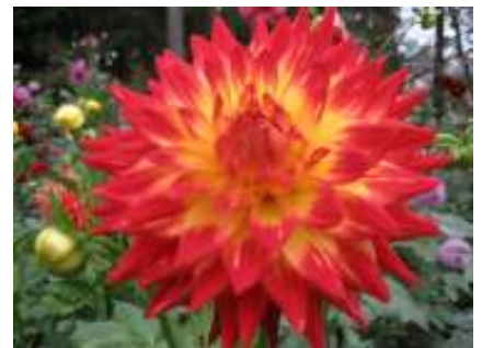
KENORA SUNSET B-SC-FL R/Y

New members will receive a free copy as part of their wel-