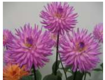
TARATAHI LILAC BB-IC-LB L/W