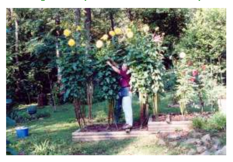
went seeing the first good bloom of a particular variety.

If you have a digital camera use it to record blooms of those you plan to keep. In the middle of winter it is always a joy to pull up a dahlia photo file and go through it, remembering the beauty of the blooms and the thrill you felt