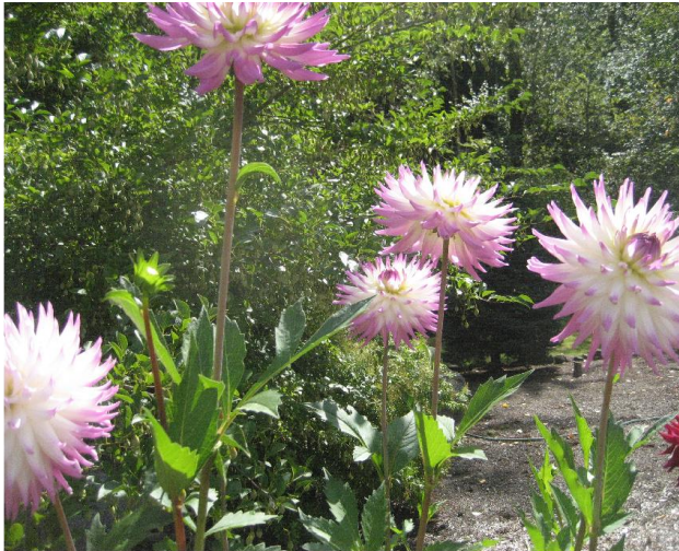
BEST SEEDLING IN NATIONAL SHOW IN CLEARVIEW GARDEN.