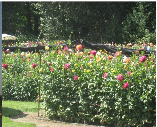
ACCENT DAHLIAS. 8,000 PLANTS. FANTASTIC!!