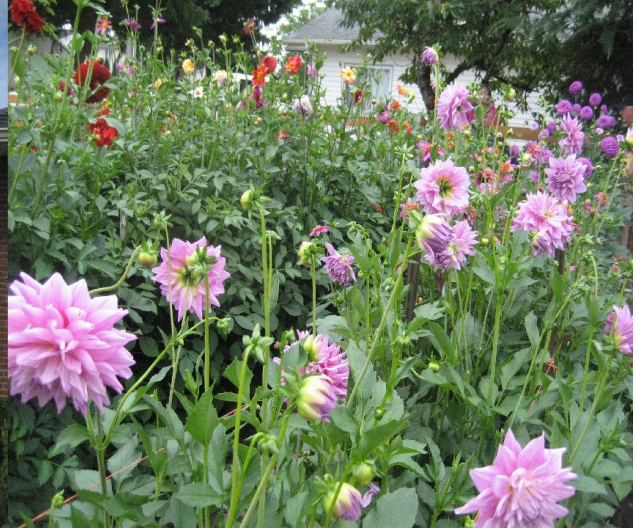
18TH SURG HOSPITAL IN VERRONE'S GARDEN