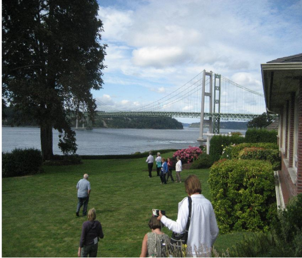
WALTON'S YARD & THE NARROWS BRIDGE