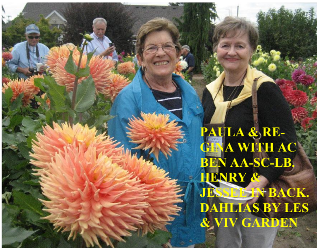
TACOMA TRIAL GARDEN IN FORT DEFENCE PARK