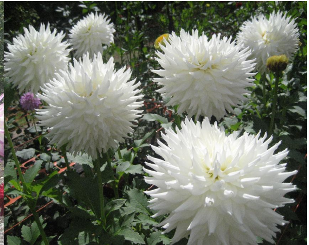
CV SNOWCAP AA-SC-W