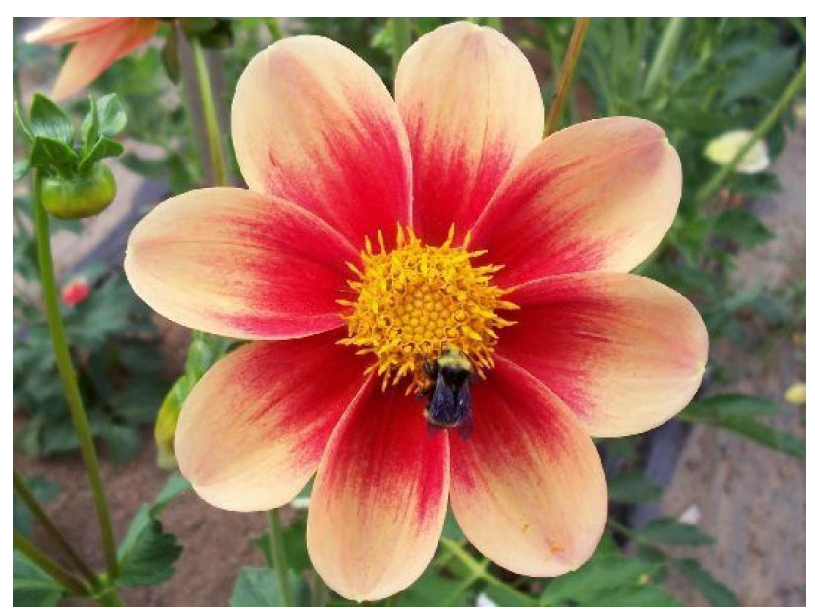
RAYANN'S PEACH S-DB OR/RD. GROWS WELL IN OUR SOUTHERN HEAT.