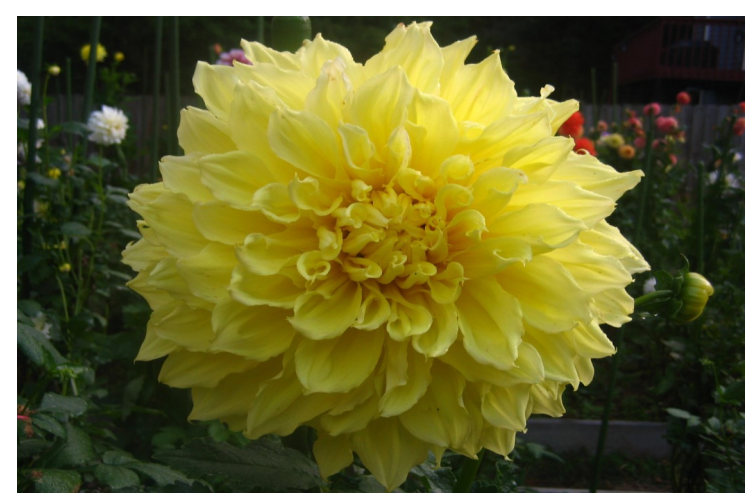
AMHURST RAYMOND A-ID-Y SCORED 89.5 IN THE TRIAL GARDEN 9 1/2", JS DAHLIAS