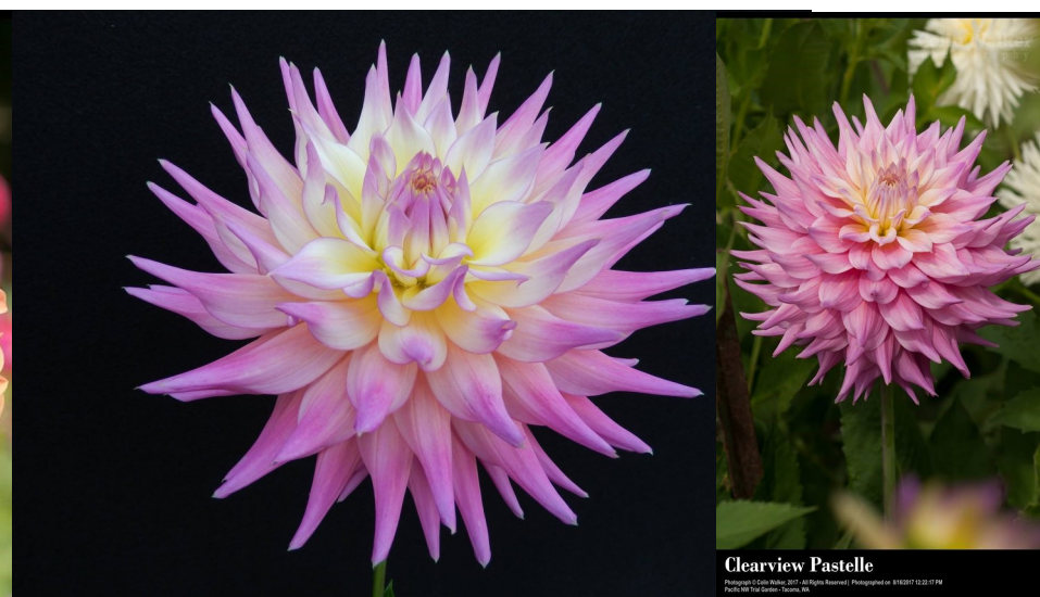
CLEARVIEW PASTELLE B-SC-LB PK/Y PICTURE TO THE RIGHT IS FROM THE TRIAL GARDEN, HART MEDAL WINNER