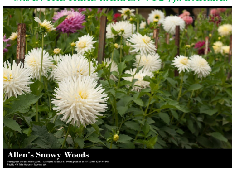
ALLEN'S SNOWY WOODS BB-LC-W COWLITZ DAHLIAS