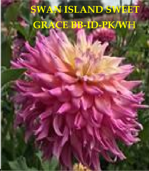
SWAN ISLAND SWEET GRACE BB-ID-PK/WH