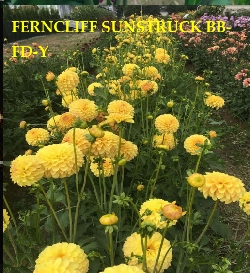
FERNCLIFF SUNSTRUCK BB-FD-Y