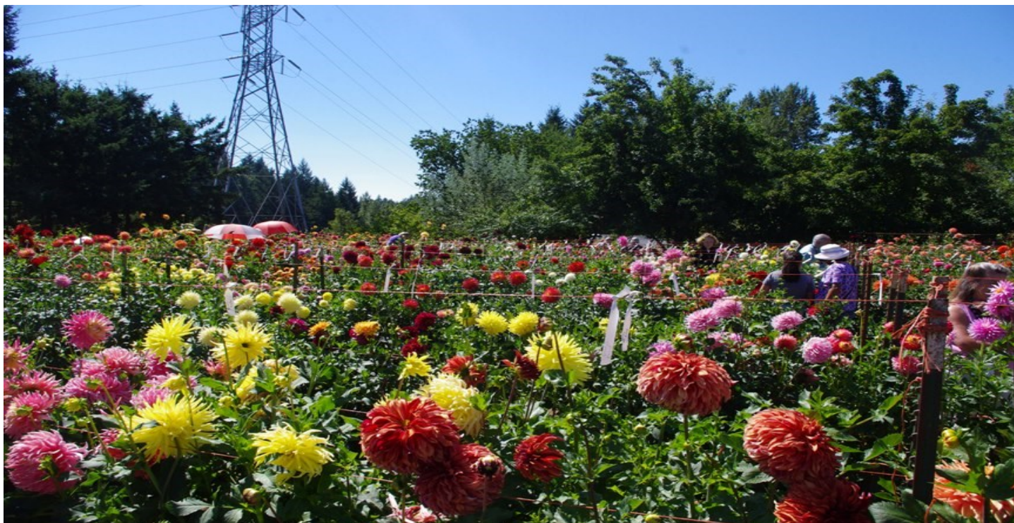
FIELD OF DAHLIAS GROWING ON THE WEST COAST