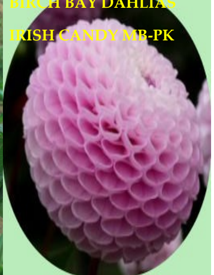
BIRCH BAY DAHLIAS IRISH CANDY MB-PK