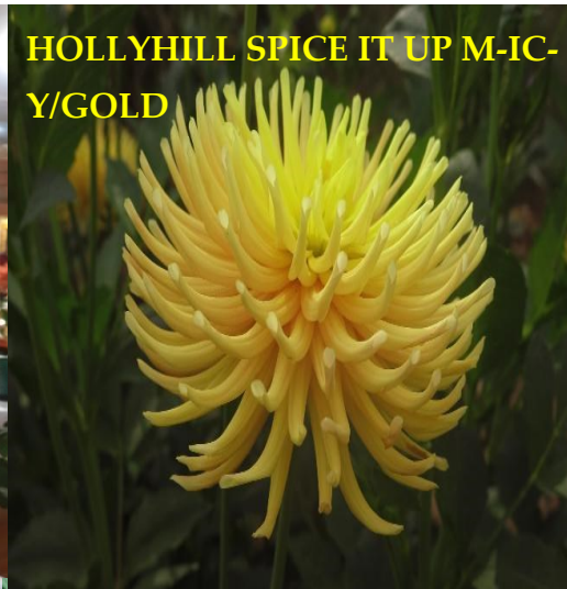
HOLLYHILL SPICE IT UP M-IC-Y/GOLD