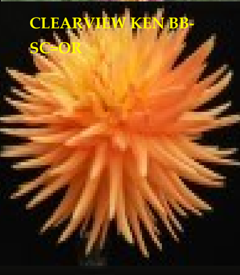
CLEARVIEW KEN BB-SC-OR