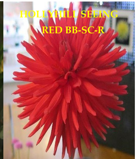
HOLLYHILL SEEING RED BB-SC-R