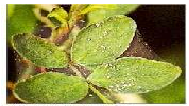
Telltale yellowing and webs are easier to see.

You will never wipe out all slugs, but by keeping you garden clean and free of debris will eliminate many places where they hide. Beer traps are known to entice and drown slugs. Ground beetles dine on slugs so be kind to them. Commercial slug bait is available but be dangerous to pets.