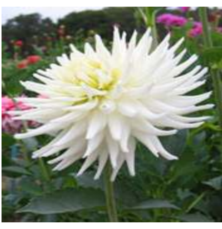
CG NORDIC B, C, W

A BEAUTIFUL NEW DAHLIA THAT GROWS WELL IN THE DEEP SOUTH