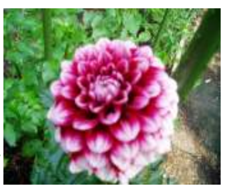
AITARA DIEDEM BB, FD, RW R/W

A BEAUTIFUL NEW DAHLIA THAT GROWS WELL IN THE DEEP SOUTH