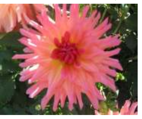
JUST PEACHY BB-SC-LB PK/Y