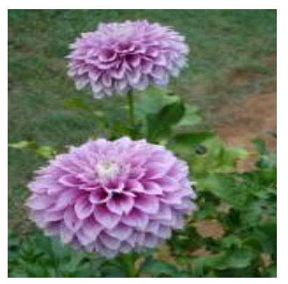
VERA'S ELMA A-FD-L