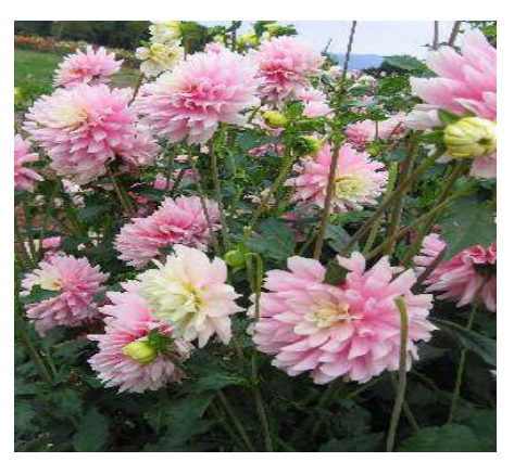
CHILSON'S PRIDE BB-ID-LB WH/PK