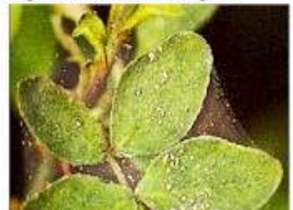
Telltale yellowing and webs are easier to see.