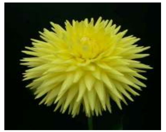
CLEARVIEW SUNDANCE A-C/SC?-Y AVG 88.63