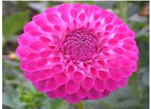
LESLIE RENEE M-FD-DB PR/LA CORRALITOS GARDENS RELEASE

The Derrill Hart award is given to those dahlias in each size category that attain the highest average scores in at least 3 trial gardens across North America. The ones shown were some that I came upon in grower catalogs or Facebook pages. The total listing will be in the December ADS Bulletin. Some of the information is missing on a couple of the pictures as it wasn't given by the grower.