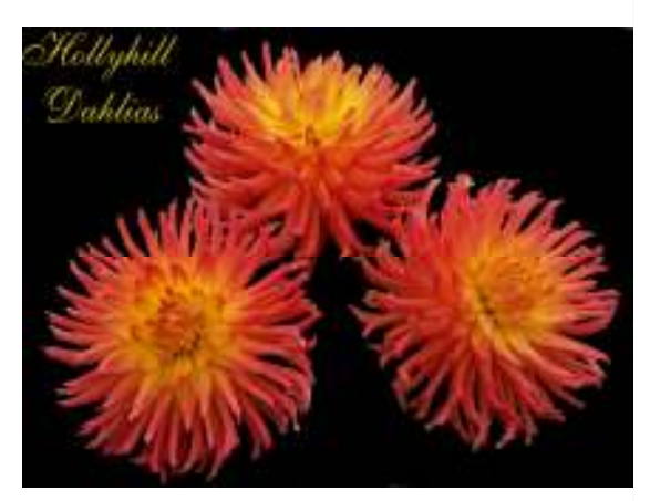
HOLLYHILL AUGSTINA B-IC-FL?