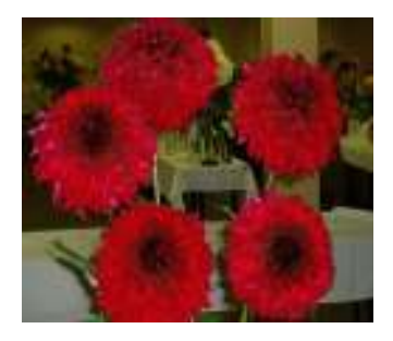
SPARTACUS A-ID-DR ANY DARK RED DAHLIA IS THE FLOWER OF THE YEAR