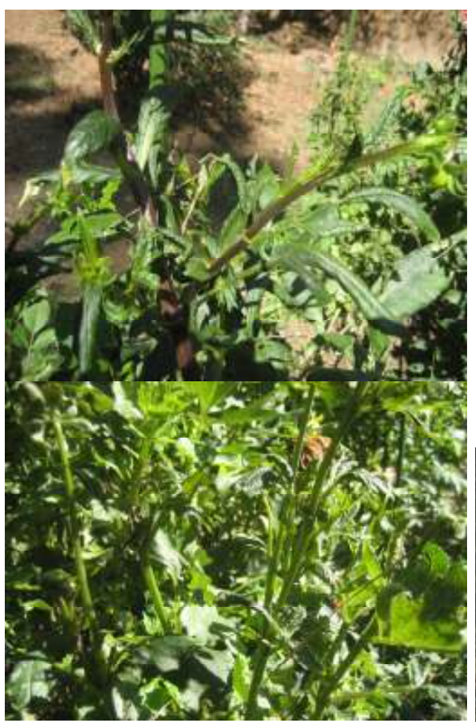
BROAD MITE DAMAGE IN MY DAHLIA GARDEN