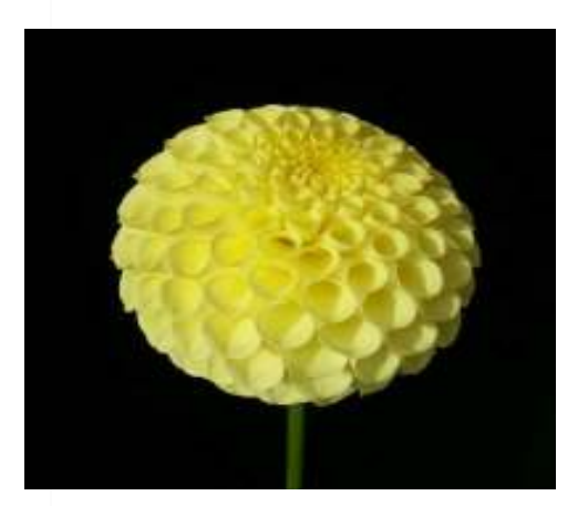
CLEARVIEW DANIEL BA-Y AVE 89.57