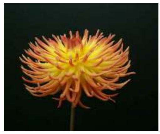
CLEARVIEW AVIA BB-IC-FL AVE 87.01