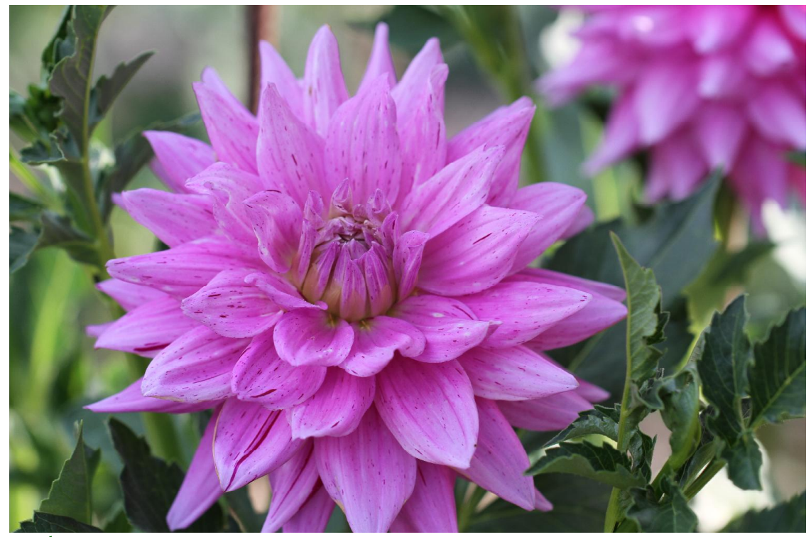
18th SURGICAL HOSPITAL B-ID-V LV/PR GROWING IN LOUISVILLE, KY

Please send any growing questions you may have to me and we will make sure you get an answer from one of our experienced growers.