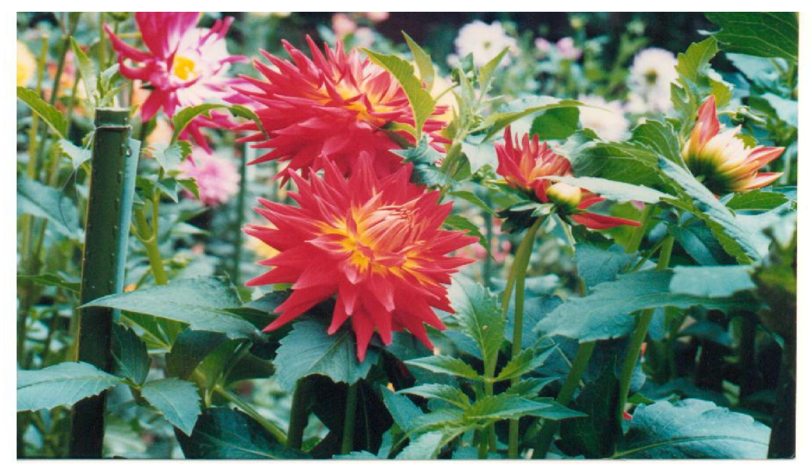
KENORA SUNSET B-SC-FL RD/YL

Yours truly will give a lecture at 10:30 AM on Saturday, September 20 on Growing Heat Tolerant Dahlias.