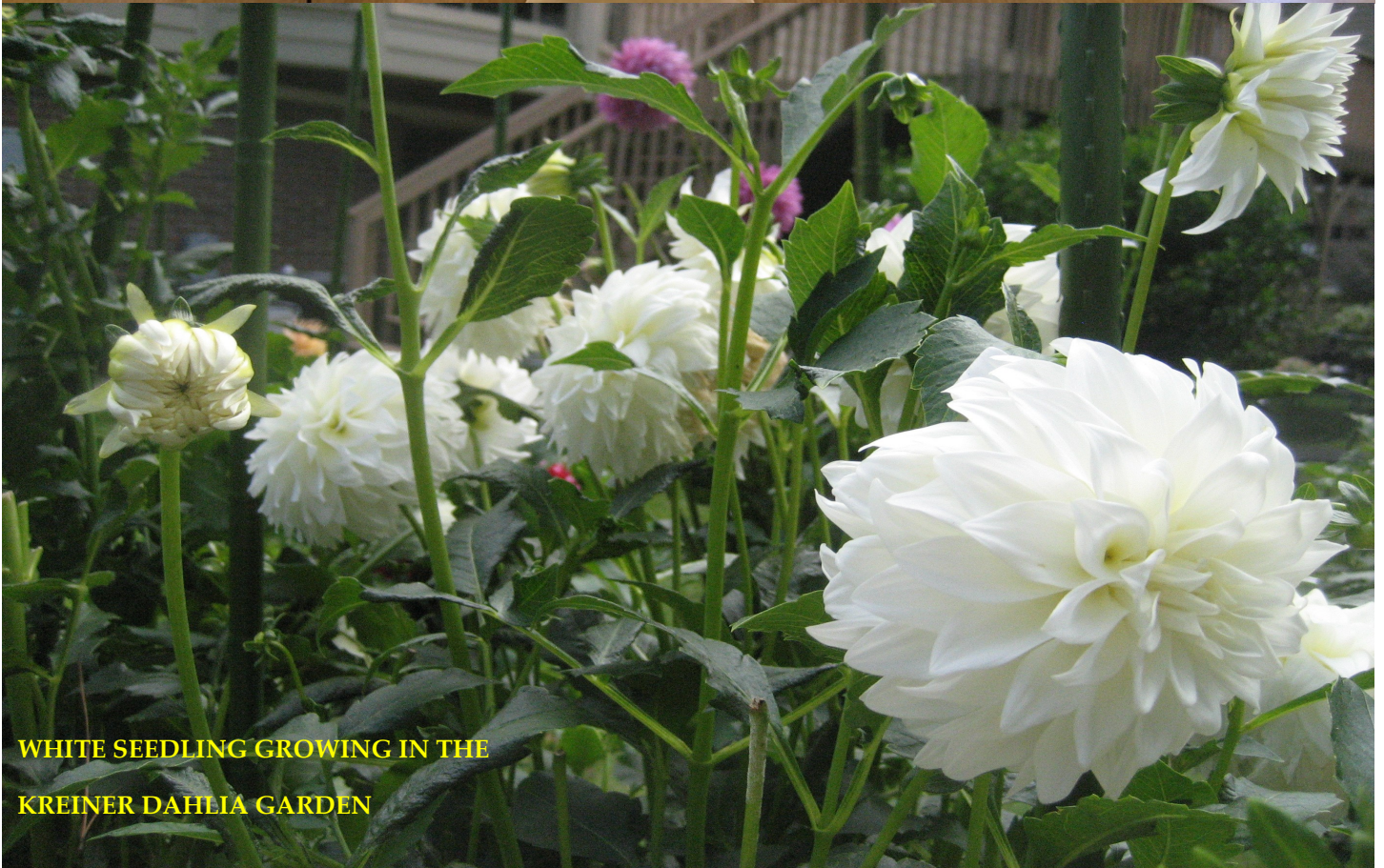
WHITE SEEDLING GROWING IN THE KREINER DAHLIA GARDEN