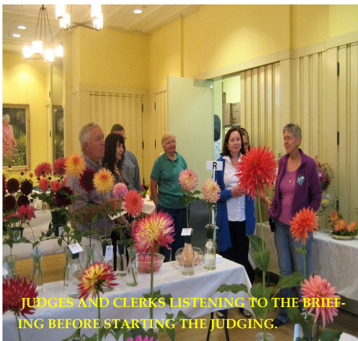
JUDGES AND CLERKS LISTENING TO THE BRIEFING BEFORE STARTING THE JUDGING.